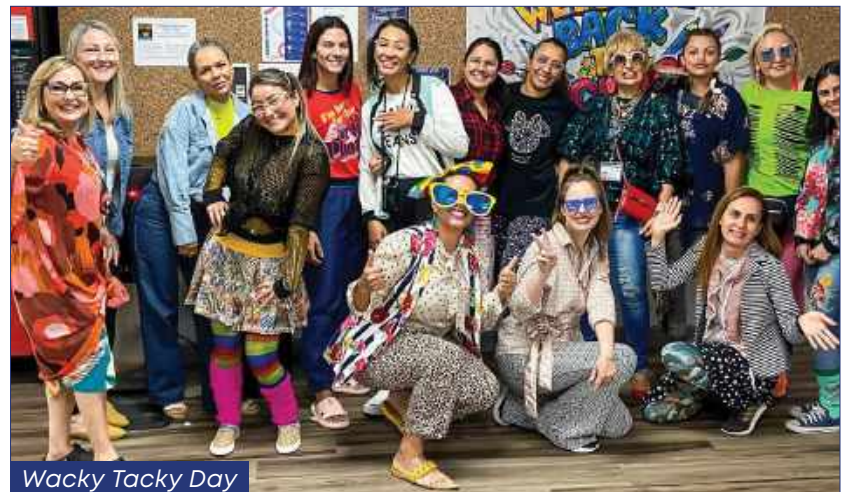
Wacky Tacky Day

Students and faculty alike enjoyed Spirit Week held September 22 nd through September 25 th . Fun was had by all!