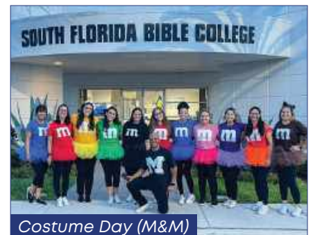
Costume Day (M&M)