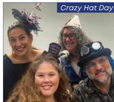
Crazy Hat Day