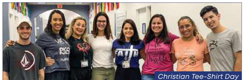
Christian Tee-Shirt Day